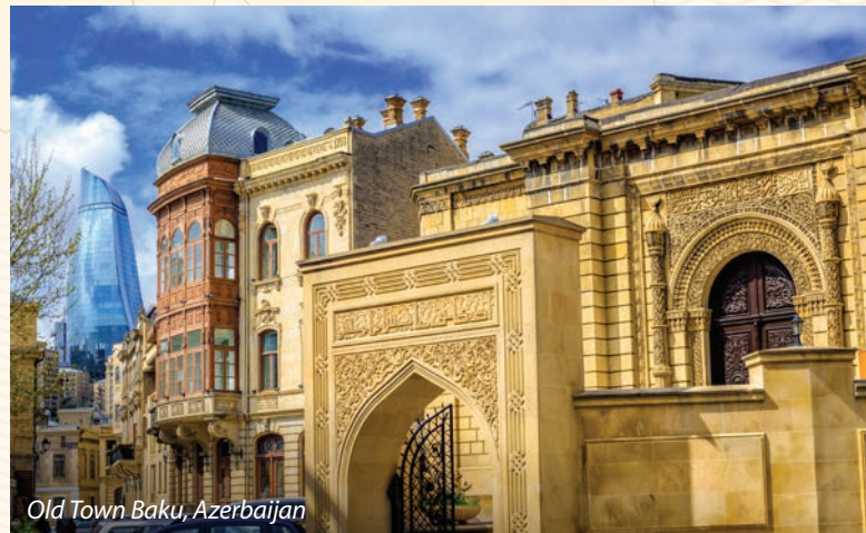
Old Town Baku, Azerbaijan